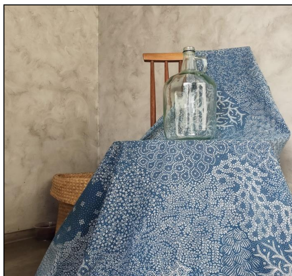
Figure 1. Natural Dyed Batik (Indigo)