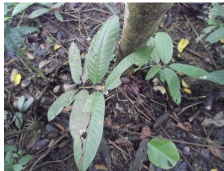
Figure 2. Seedling of Goniothalamus macrophyllus

The highest INP value at the seedling level is Coffea spp. with a value of 141.46% at an altitude of 695 m above sea level, while the lowest INP value was G. macrophyllus with a value of 20.51% at an altitude of 859 m asl. G. macrophyllus at seedling level is dominant at an altitude of 442 m asl, 859 m asl, and 1,175 m asl. with respective values of 25.58%, 20.51%, and 29.28%. G. macrophyllus seedlings can be seen in Figure 2.