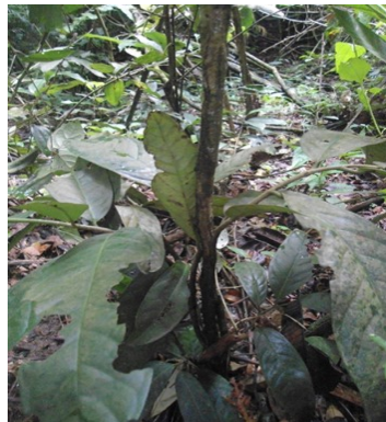
Figure 3. Sapling of Goniothalamus macrophyllus

The highest INP value at the sapling level is Decapernum paniculatum with a value of 47.62% at an altitude of 432 m asl., While the lowest INP value is Ki Surawung with a value of 18.83% at an altitude of 859 m asl. G. macrophyllus at dominant sapling level at an altitude of 864 m asl., 997 m asl., And 1,175 m asl. with respective values of 26.21%, 44.48%, and 33.69%. sapling of G. macrophyllus can be seen in Figure 3.