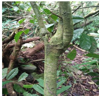
Figure 4. Poles of Goniothalamus macrophyllum

The highest INP value at the pole level was Villebrunea rubenscens with a value of 248.83%, while the lowest INP value was Maesopsis eminii with a value of 7.05. At the pole level G. macrophyllum did not dominate. Poles of G. macrophyllum can be seen in Figure 4.