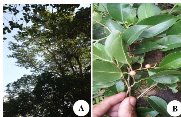
Figure 2. Ficus benjamina : A. Tree, B. Fruit