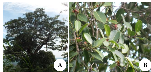
Figure 3. Ficus sinuata : A. Tree, B. Fruit