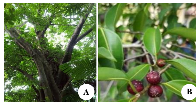
Figure 4. Ficus kurzii : A. tree, B. fruit