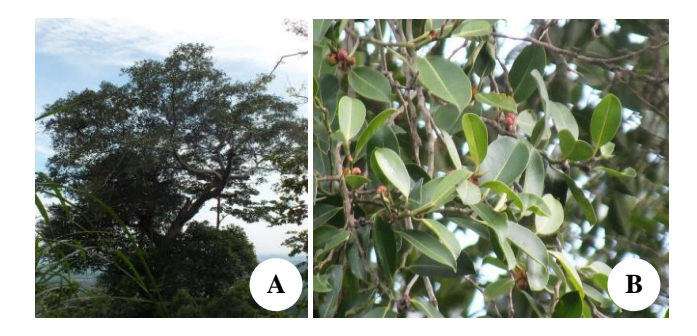
Figure 3. Ficus sinuata: A. Tree, B. Fruit