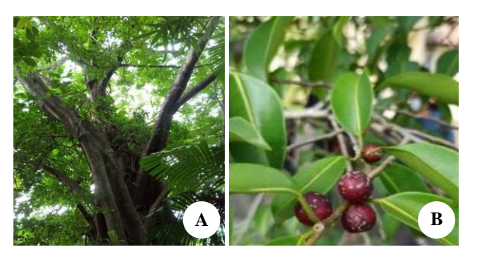
Figure 4. Ficus kurzii: A. tree, B. fruit