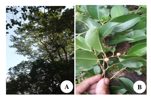
Figure 2. Ficus benjamina: A. Tree, B. Fruit